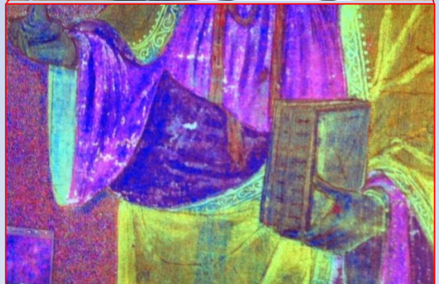
Top: HySpex system installed at the Louvre Museum. Bottom: First test revealed previously invisible features on the lady's clothing.